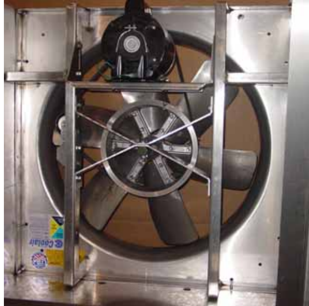
NBF/AL24 with motor mounted at the top of the fan

The motor bracket should be mounted to the fan uprights in the 1 st and 3 rd holes from the end of each upright, using the existing 5/16" hardware. The belt tensioner should be mounted to the right upright (when viewed from the rear) in the 9 th and 10 th holes from the end of the upright, using the 5/16" hardware supplied.