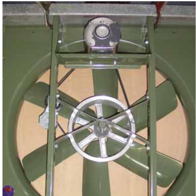
NBF/AL30 with motor mounted at the top of the fan

The motor bracket should be mounted to the fan uprights in the 2 nd and 4 th holes from the end of each upright, using the existing 5/16" hardware. The belt tensioner should be mounted to the right upright (when viewed from the rear) in the 8 th and 9 th holes from the end of the upright, using the 5/16" hardware supplied.