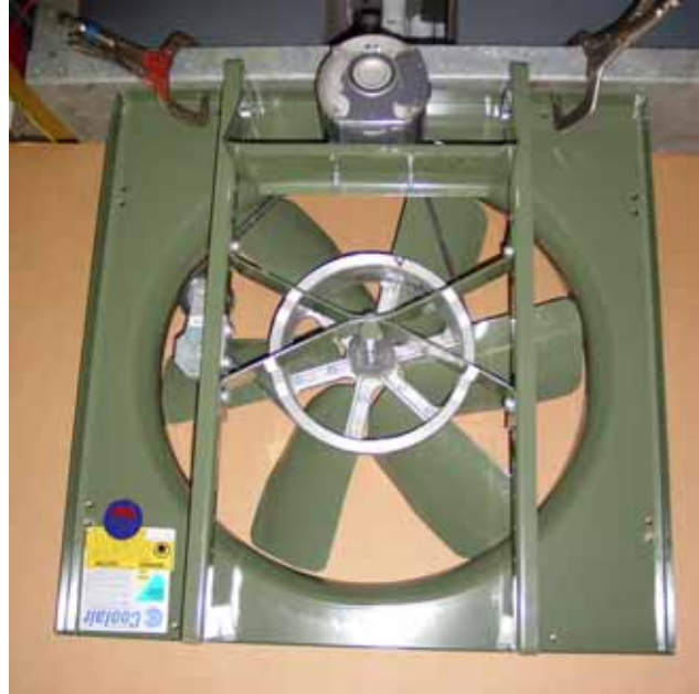
NBF/AL24 with motor mounted at the top of the fan

The motor bracket should be mounted to the fan uprights in the 1 st and 3 rd holes from the end of each upright, using the existing 5/16" hardware. The belt tensioner should be mounted to the right upright (when viewed from the rear) in the 9 th and 10 th holes from the end of the upright, using the 5/16" hardware supplied.