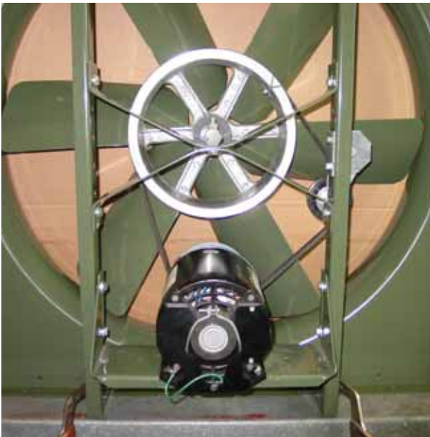
NBF/AL30 with motor mounted at the bottom of the fan

The motor bracket should be mounted to the fan uprights in the 1 st and 3 rd holes from the end of each upright, using the existing 5/16" hardware. The belt tensioner should be mounted to the left upright (when viewed from the rear) in the 9 th and 10 th holes from the end of the upright, using the 5/16" hardware supplied.