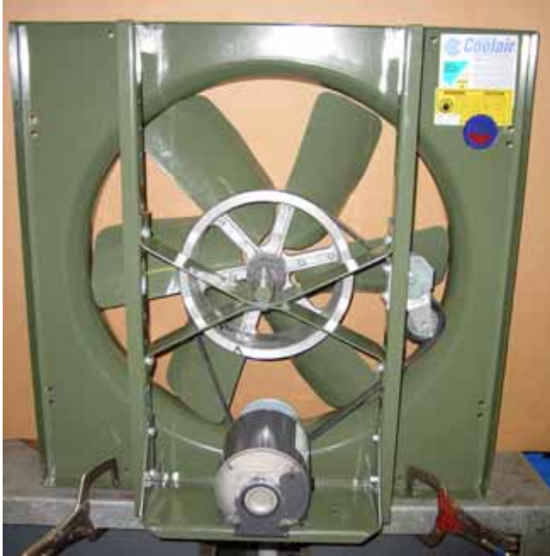
NBF/AL24 with motor mounted at the bottom of the fan

The motor bracket should be mounted to the fan uprights in the 1 st and 3 rd holes from the end of each upright, using the existing 5/16" hardware. The belt tensioner should be mounted to the right upright (when viewed from the rear) in the 9 th and 10 th holes from the end of the upright, using the 5/16" hardware supplied.