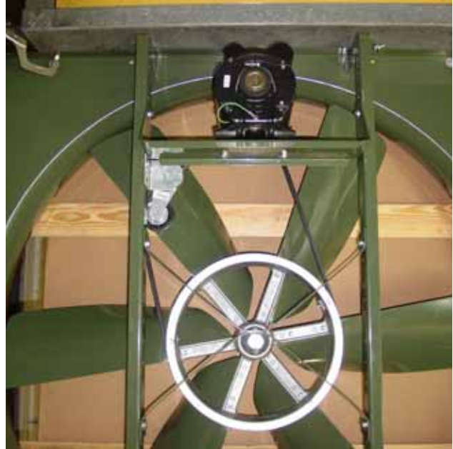
NBF/NCFB48 with motor mounted at the top of the fan

The motor bracket should be mounted to the fan uprights in the 3 rd and 5 th holes from the end of each upright, using the existing 5/16" hardware. The belt tensioner should be mounted to the right upright (when viewed from the rear) in the 7 th and 8 th holes from the end of the upright, using the 5/16" hardware supplied.