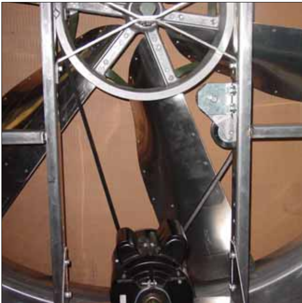
AL54 with motor mounted at the bottom of the fan

The motor bracket should be mounted to the fan uprights in the 4 th and 6 th holes from the end of each upright, using the existing 5/16" hardware. The belt tensioner should be mounted to the left upright (when viewed from the rear) in the 7 th and 8 th holes from the end of the upright, using the 5/16" hardware supplied.