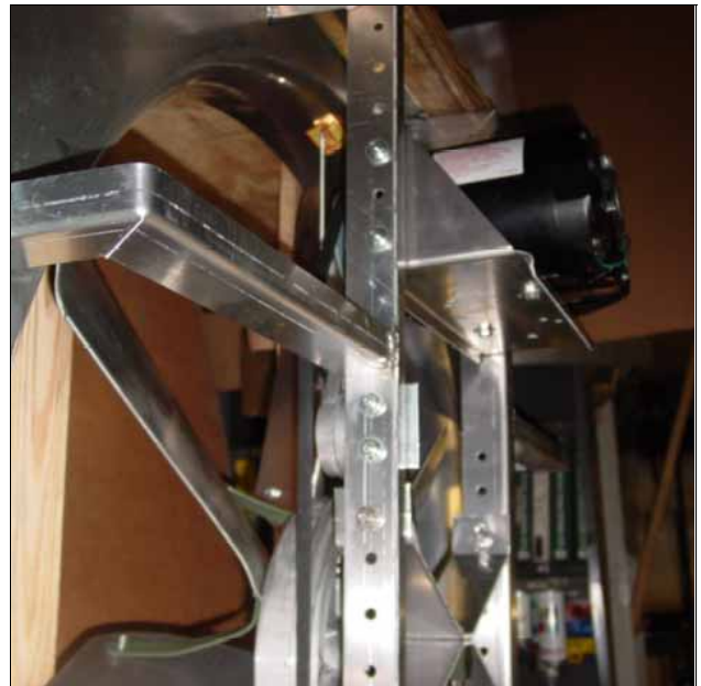
AL42 with motor mounted at the top of the fan

The motor bracket should be mounted to the fan uprights in the 3 rd and 5 th holes from the end of each upright, using the existing 5/16" hardware. The belt tensioner should be mounted to the right upright (when viewed from the rear) in the 8 th and 9 th holes from the end of the upright, using the 5/16" hardware supplied.