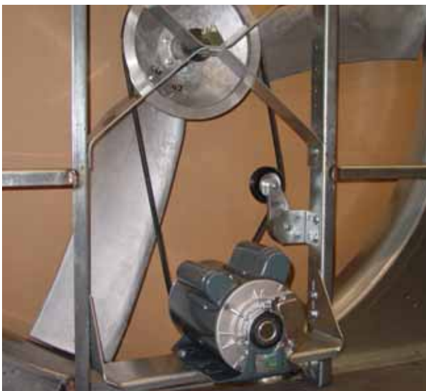
NBCB52 with motor mounted at the bottom of the fan

The motor bracket should be mounted to the fan uprights in the 4 th and 6 th holes from the end of each upright, using the existing 5/16" hardware. The belt tensioner should be mounted to the left upright (when viewed from the rear) in the 7 th and 8 th holes from the end of the upright, using the 5/16" hardware supplied.