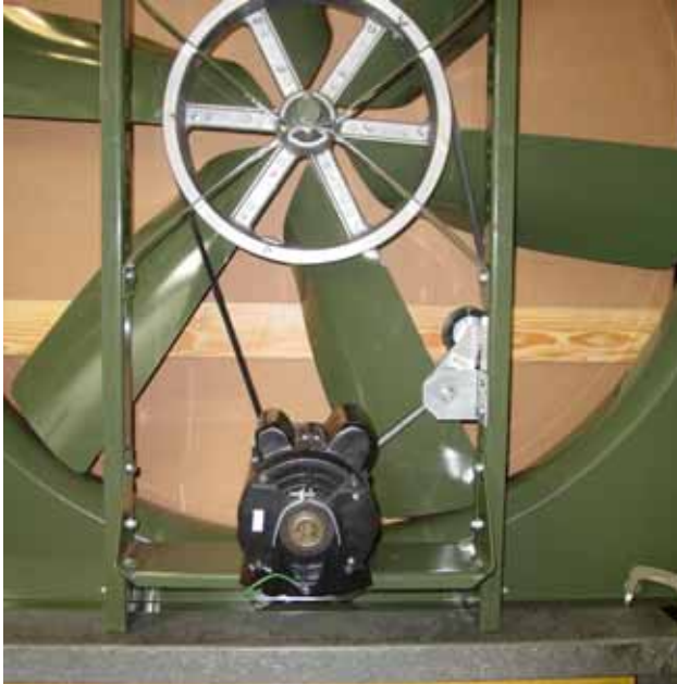
NBF/NCFB48 with motor mounted at bottom of the fan

The motor bracket should be mounted to the fan uprights in the 3 rd and 5 th holes from the end of each upright, using the existing 5/16" hardware. The belt tensioner should be mounted to the right upright (when viewed from the rear) in the 7 th and 8 th holes from the end of the upright, using the 5/16" hardware supplied.