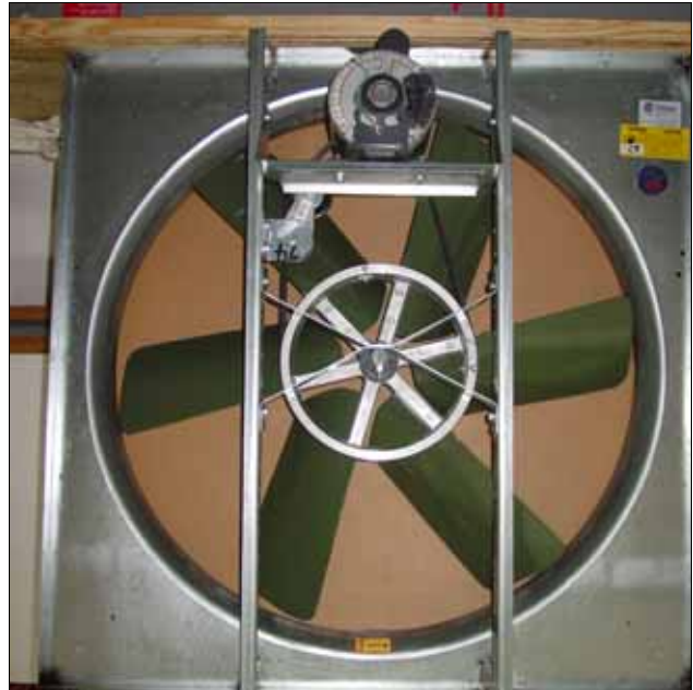
NCFA36 with motor mounted at the top of the fan

The motor bracket should be mounted to the fan uprights in the 3 rd and 5 th holes from the end of each upright, using the existing 5/16" hardware. The belt tensioner should be mounted to the right upright (when viewed from the rear) in the 7 th and 8 th holes from the end of the upright, using the 5/16" hardware supplied.