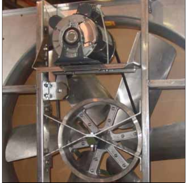
AL36 with motor mounted at the top of the fan

The motor bracket should be mounted to the fan uprights in the 2 nd and 4 th holes from the end of each upright, using the existing 5/16" hardware. The belt tensioner should be mounted to the right upright (when viewed from the rear) in the 6 th and 7 th holes from the end of the upright, using the 5/16" hardware supplied.