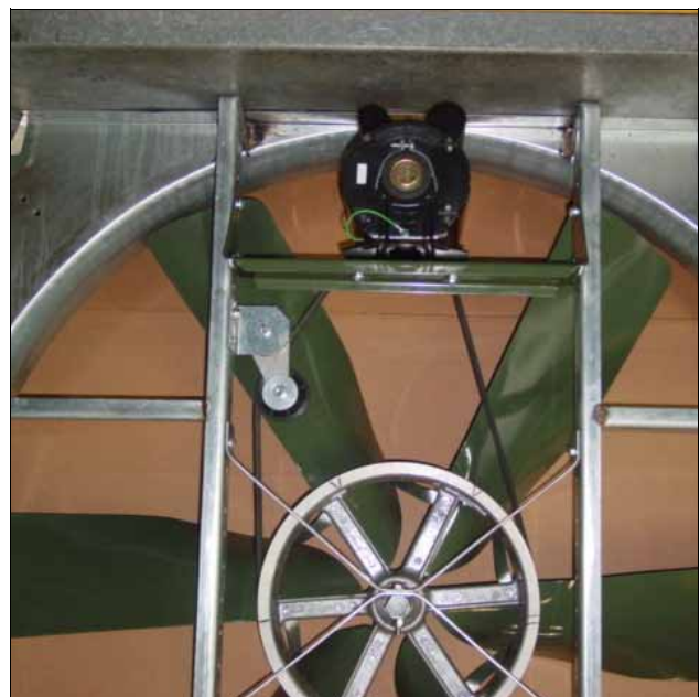
NCF52 with motor mounted at the top of the fan

The motor bracket should be mounted to the fan uprights in the 2 nd and 4 th holes from the end of each upright, using the existing 5/16" hardware. The belt tensioner should be mounted to the right upright (when viewed from the rear) in the 7 th and 8 th holes from the end of the upright, using the 5/16" hardware supplied.