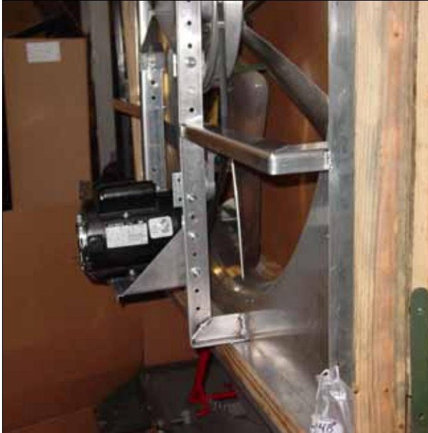
AL48 with motor mounted at the bottom of the fan

The motor bracket should be mounted to the fan uprights in the 3 rd and 5 th holes from the end of each upright, using the existing 5/16" hardware. The belt tensioner should be mounted to the right upright (when viewed from the rear) in the 7 th and 8 th holes from the end of the upright, using the 5/16" hardware supplied.