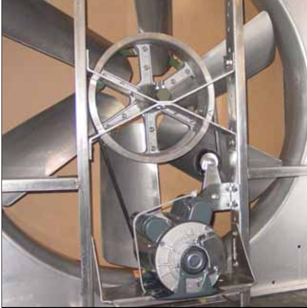
AL36 with motor mounted at the bottom of the fan

The motor bracket should be mounted to the fan uprights in the 2 nd and 4 th holes from the end of each upright, using the existing 5/16" hardware. The belt tensioner should be mounted to the right upright (when viewed from the rear) in the 6 th and 7 th holes from the end of the upright, using the 5/16" hardware supplied.