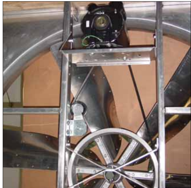
AL54 with motor mounted at the top of the fan

The motor bracket should be mounted to the fan uprights in the 3 rd and 5 th holes from the end of each upright, using the existing 5/16" hardware. The belt tensioner should be mounted to the right upright (when viewed from the rear) in the 9 th and 10 th holes from the end of the upright, using the 5/16" hardware supplied.