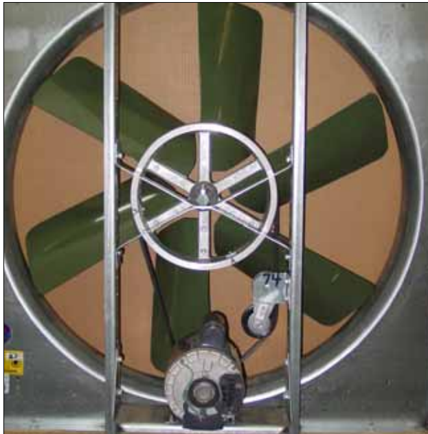
NCFA36 with motor mounted at the bottom of the fan

The motor bracket should be mounted to the fan uprights in the 3 rd and 5 th holes from the end of each upright, using the existing 5/16" hardware. The belt tensioner should be mounted to the right upright (when viewed from the rear) in the 7 th and 8 th holes from the end of the upright, using the 5/16" hardware supplied.