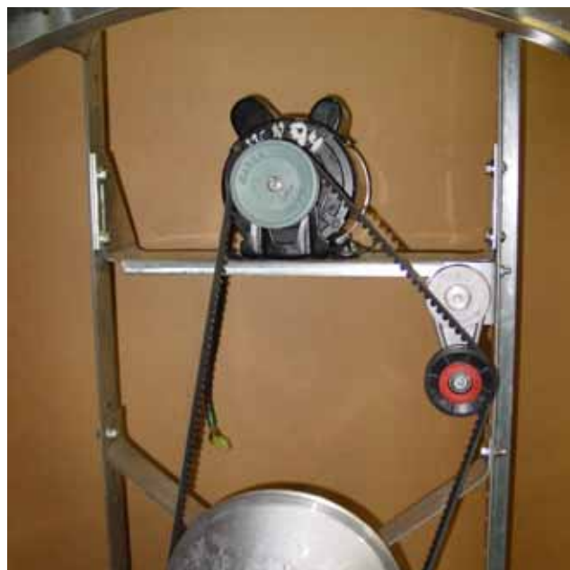
NBCB52 with motor mounted at the top of the fan

The motor bracket should be mounted to the fan uprights in the 3 rd and 4 th holes from the end of each upright, centered vertically, using the existing 5/16" hardware. The belt tensioner should be mounted to the right upright (when viewed from the rear) in the 7 th and 8 th holes from the end of the upright, using the 5/16" hardware supplied. Note: It may be necessary to slightly adjust the motor bracket in it's slots to achieve proper belt tension.