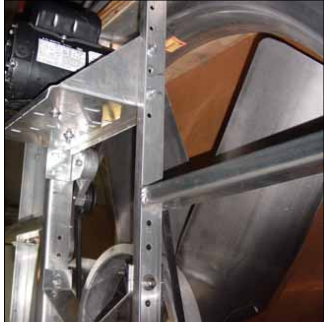
AL48 with motor mounted at the top of the fan

The motor bracket should be mounted to the fan uprights in the 3 rd and 5 th holes from the end of each upright, using the existing 5/16" hardware. The belt tensioner should be mounted to the right upright (when viewed from the rear) in the 7 th and 8 th holes from the end of the upright, using the 5/16" hardware supplied.