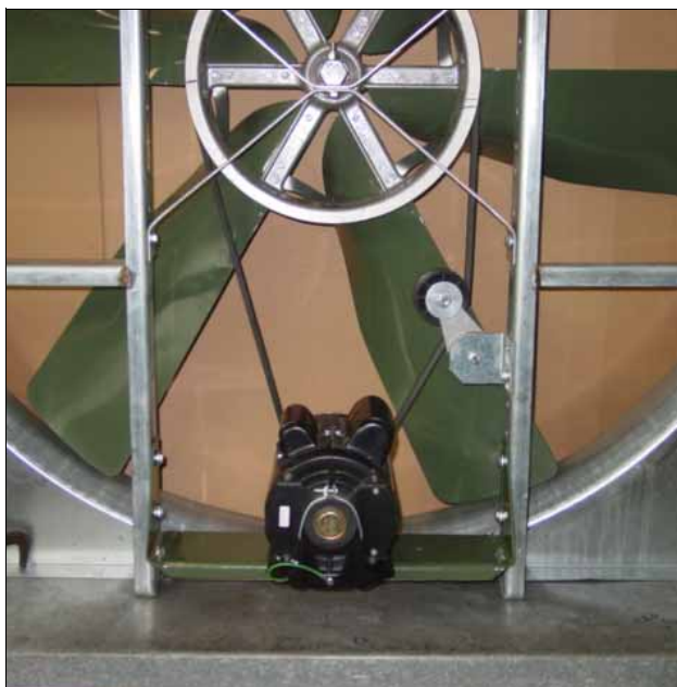
NCF52 with motor mounted at the bottom of the fan

The motor bracket should be mounted to the fan uprights in the 3 rd and 5 th holes from the end of each upright, using the existing 5/16" hardware. The belt tensioner should be mounted to the left upright (when viewed from the rear) in the 7 th and 8 th holes from the end of the upright, using the 5/16" hardware supplied.