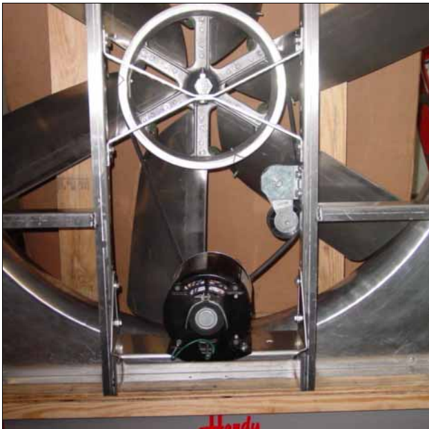
AL42 with motor mounted at the bottom of the fan

The motor bracket should be mounted to the fan uprights in the 4 th and 5 th holes from the end of each upright, using the existing 5/16" hardware. The belt tensioner should be mounted to the left upright (when viewed from the rear) in the 8 th and 9 th holes from the end of the upright, using the 5/16" hardware supplied.